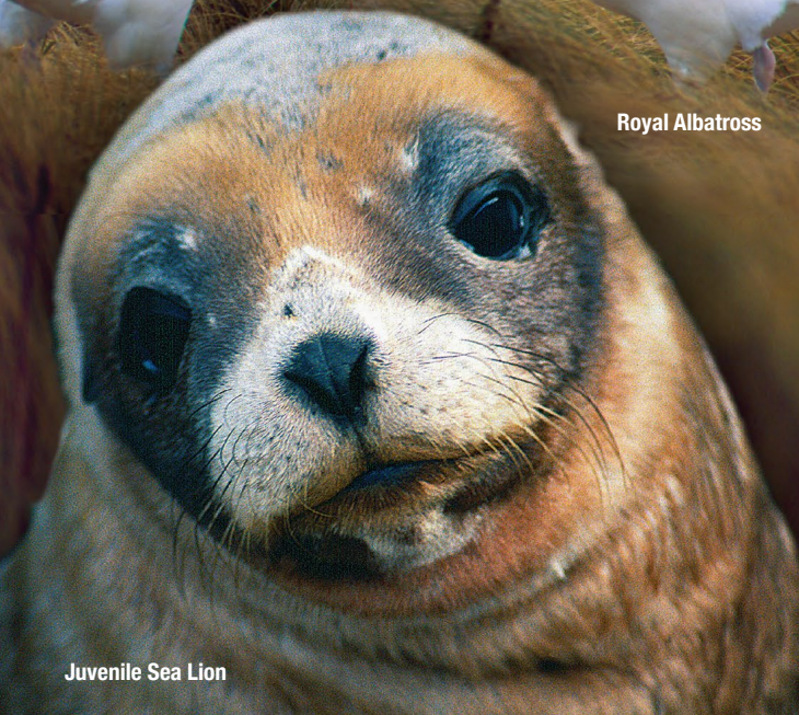
Juvenile Sea Lion