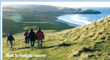
Walk to Penguin reserve