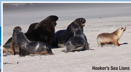
Hooker's Sea Lions