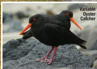
Variable Oyster Catcher