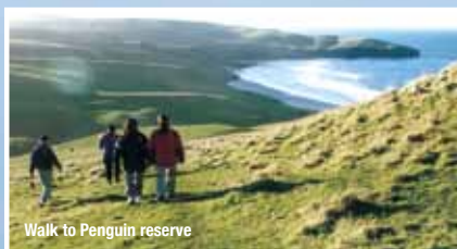
Walk to Penguin reserve