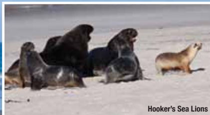
Hooker's Sea Lions