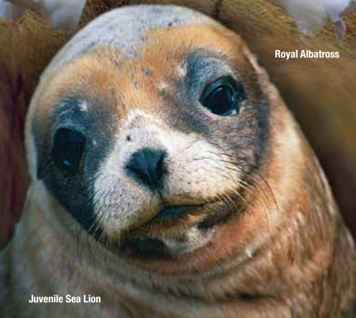
Juvenile Sea Lion