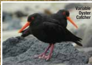
Variable Oyster Catcher